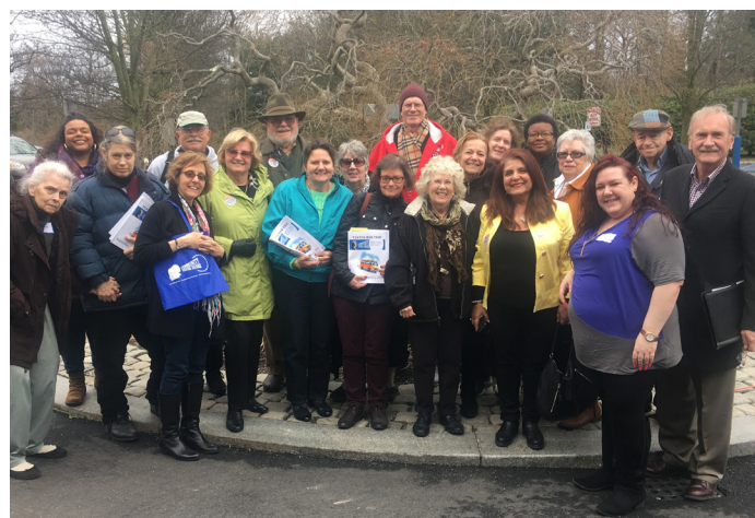
UUCSR delegation to Community Voices Heard

The first stop on the trip was at a public housing complex in East Harlem where we observed Participatory Budgeting (PB), a process in which community members generate ideas and vote on projects that can be funded by their city council member's discretionary budget.