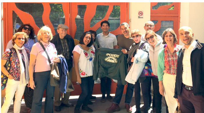
The Veatch delegation with staff from PODER

In mid-May, members of the UUCSR Veatch Program Board of Governors and staff, and the UUCSR Board of Trustees, traveled to Oakland, CA to participate in an educational site visit of progressive activity throughout the state.