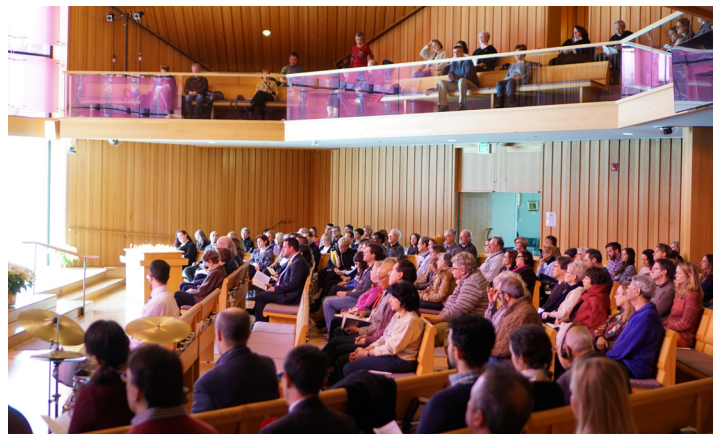
Unitarian Universalist Congregation at Shelter Rock