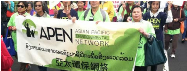
APEN members take to the streets to fight for climate justice.

The devastation wrought by Hurricane Dorian is an important reminder that climate change-fueled natural disasters hit the most vulnerable populations the hardest. It's no accident that the Abaco Islands in the Bahamas, home to a large Haitian immigrant community, was most decimated by the storm. This is why we partner with so many Veatch grantees to wage environmental justice campaigns aimed at lessening the disproportionate impact of climate change on low-income and immigrant communities.