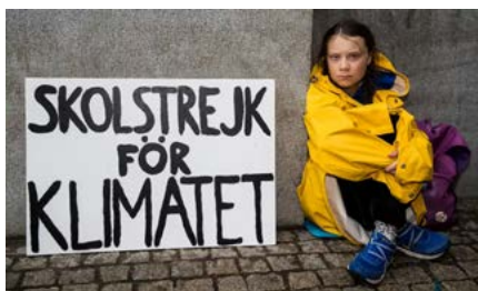
Greta Thunberg “Striking for the Planet” outside the Swedish Parliament.

Most people who travel from England to the United States fly. Greta Thunberg is definitely not “most people.” The 16 year-old climate activist from Sweden, who will be attending the UN General Assembly Sessions in NYC in September, has renounced air travel because of its enormous carbon foot print. Instead, she made a zero-emissions, 15-day voyage across the Atlantic in the solar powered yacht, the Maliza II.