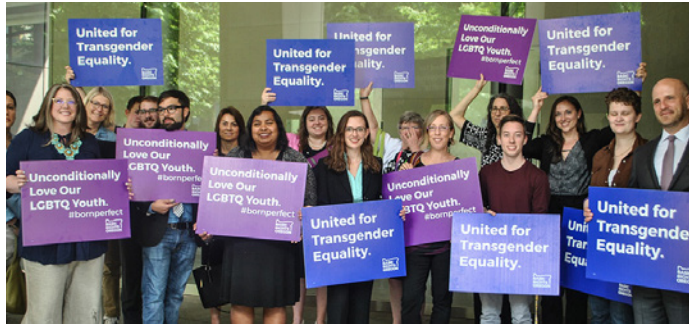
Veatch grantee Basic Rights Education Fund promotes and protects the rights of LGBTQ people in Oregon.

– in this case, a Pap screening – led to the discovery of pre-cancerous cells. Even though a hysterectomy was recommended by his new, qualified, physician, his insurance provider denied the treatment. As he waited for approval for the procedure, he, along with Basic Rights and other allied organizations, worked diligently to change discriminatory policies that impact all Oregonians. He testified before the state legislature, advocating for a new bill, that among other protections will prohibit the denial of benefits to an employee based on their gender identity.