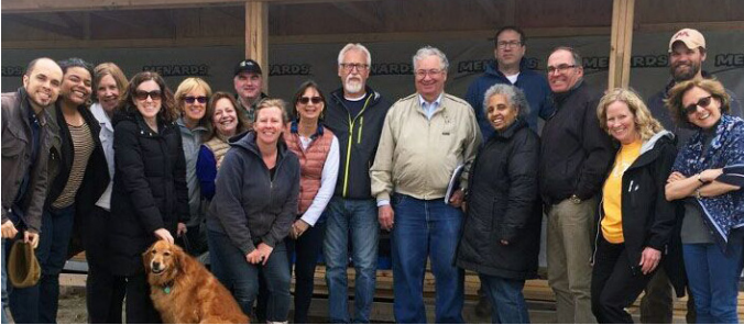
The Veatch delegation meets with leaders of grantee Land Stewardship Project at Waxwing Farm in Minnesota.