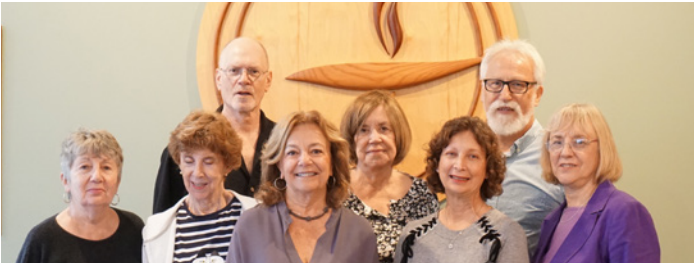
Veatch Board of Governors