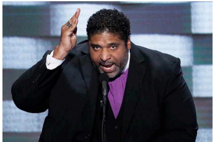
Rev. William Barber's book "The Third Reconstruction" is an example of the social justice literature that Beacon Press publishes today.

media, their intelligent and often ferocious response to the rapidly escalating issues of white supremacy, gun violence, xenophobia, and sexual harassment. Stoic and confident, they named and shamed the perpetrators pushing our country away from the democratic values we strive to safeguard and replicate.