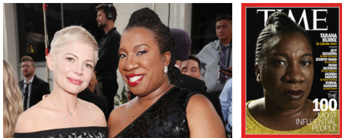
Left: Actress Michelle Williams with Tarana Burke, creator of the #Me Too movement, at the Golden Globes Awards. / Right: Veatch grantee Blackbird's work to promote the story of Tarana Burke contributed to her being named as one of Time Magazine's 100 Most Influential People.

Recognizing and honoring the dignity of every human, a UU principle, is demonstrated in both thought and deed by Veatch Program grantee, Blackbird.