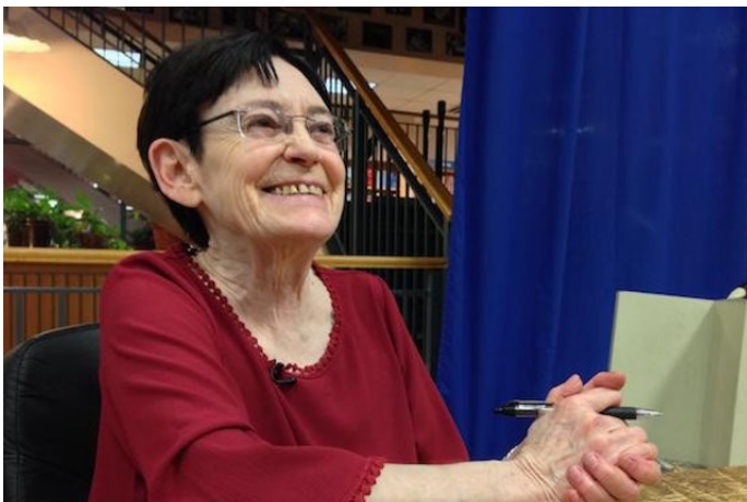
Beacon Press author Roxanne Dunbar Ortiz's book "An Indigenous People's History of the United States" is a popular title.

But Beacon never changed. Since then, they have continued to be a shining light of conscience and compassion in increasingly anxious times. In the nearly 18 months of the new administration, Beacon Press has amplified, through blog posts, opinion pieces, and social